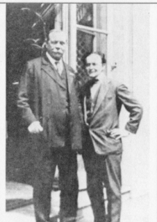
Sir Arthur Conan Doyle and Houdini