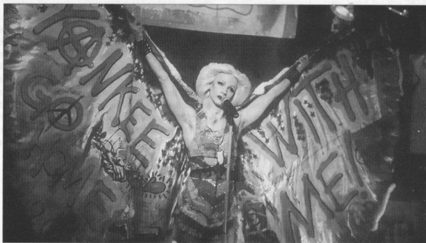
John Cameron Mitchell in the 2001 film of Hedwig and the Angry Inch.