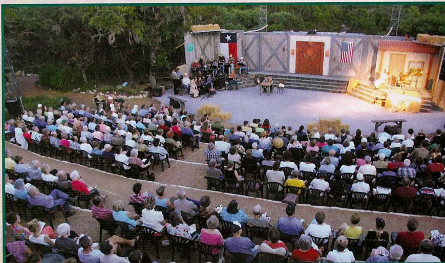
Main Stage - 2008 performance of The Gospel Accordin' to Texas

The EmilyAnn was founded in 1998 to celebrate the life of Emily Ann Rolling by providing a permanent home for Shakespeare Under the Stars. Today The EmilyAnn is so much more than a theatre. Visitors are welcome daily to our 12-acre site to walk through our gardens, enjoy our life-size chess/checker board and interactive musical garden, spend time bird and butterfly watching, eat a picnic lunch, visit the Veterans Memorial Plaza or simply enjoy the peaceful environment of the grounds. Our expanded name the EmilyAnn Theatre & Gardens reflects the important role our grounds play in fulfilling our mission--to reinvest in the dignity of the human spirit. Enjoy your visit and come see us again soon!