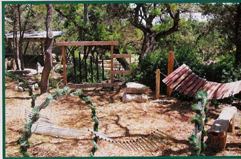
Donated by the Rotary Club of Wimberley